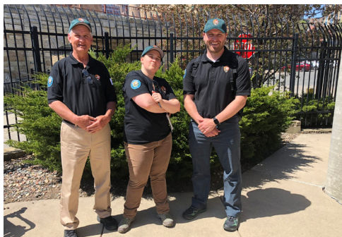
River Educators at Upper St. Anthony Falls Lock and Dam.

During the month of May, hundreds of Twin Cities kids experienced one of two new pilot education programs called River Learning Journeys at St. Anthony Falls in Minneapolis and Harriet Island in Saint Paul. The St. Anthony Falls field trip gave students opportunities to learn — and take photographs — of the falls, lock and dam, historic mill ruins, and the Stone Arch Bridge. From Harriet Island, students traveled upstream to learn about the Mississippi River's ecosystem on a paddleboat. They observed animal and plant life in the river's floodplain, examined mussels that live on the river bottom, and learned about the life-cycle of fish that swim in the river.