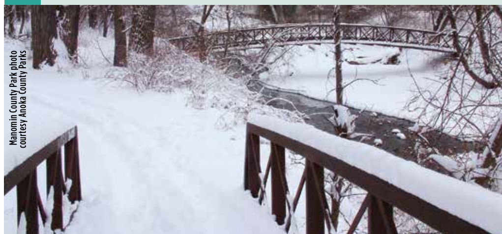
Manomin County Park

Nearby, the Mississippi River Regional Trail will take you nine miles upstream, into the city of Anoka, or five miles downstream to Minneapolis. Manomin County Park’s address is 6666 East River Road, Fridley.