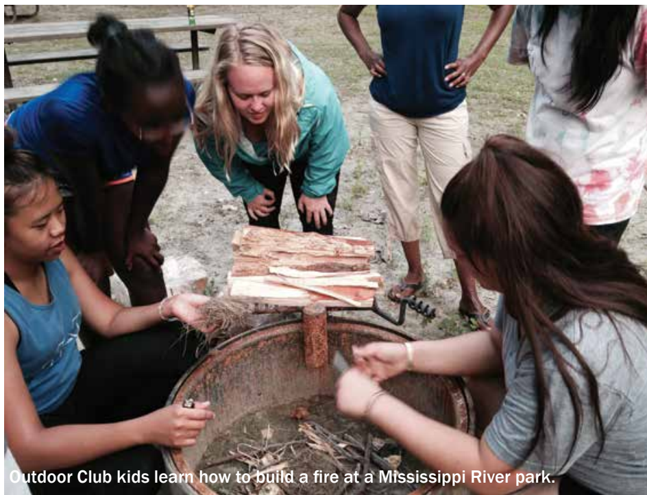
Outdoor Club kids learn how to build a fire at a Mississippi River park.

Thanks to the National Park Foundation for supporting this work.